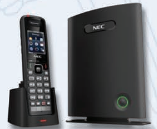
Wireless IP DECT